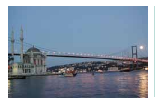
Congress dates Wednesday, 5 June – Saturday, 8 June 2013