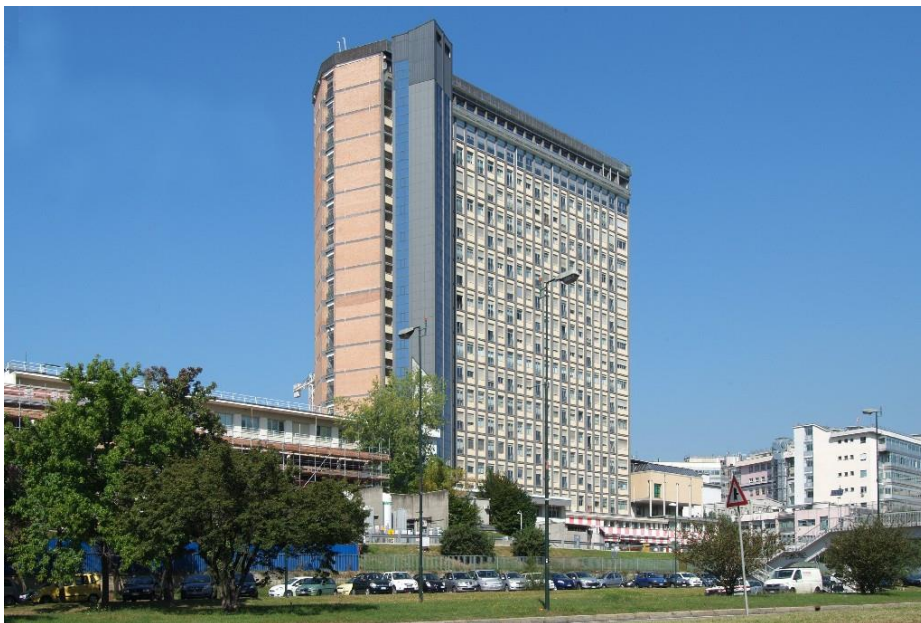
Centro Traumatologico Ortopedico (CTO), Turin