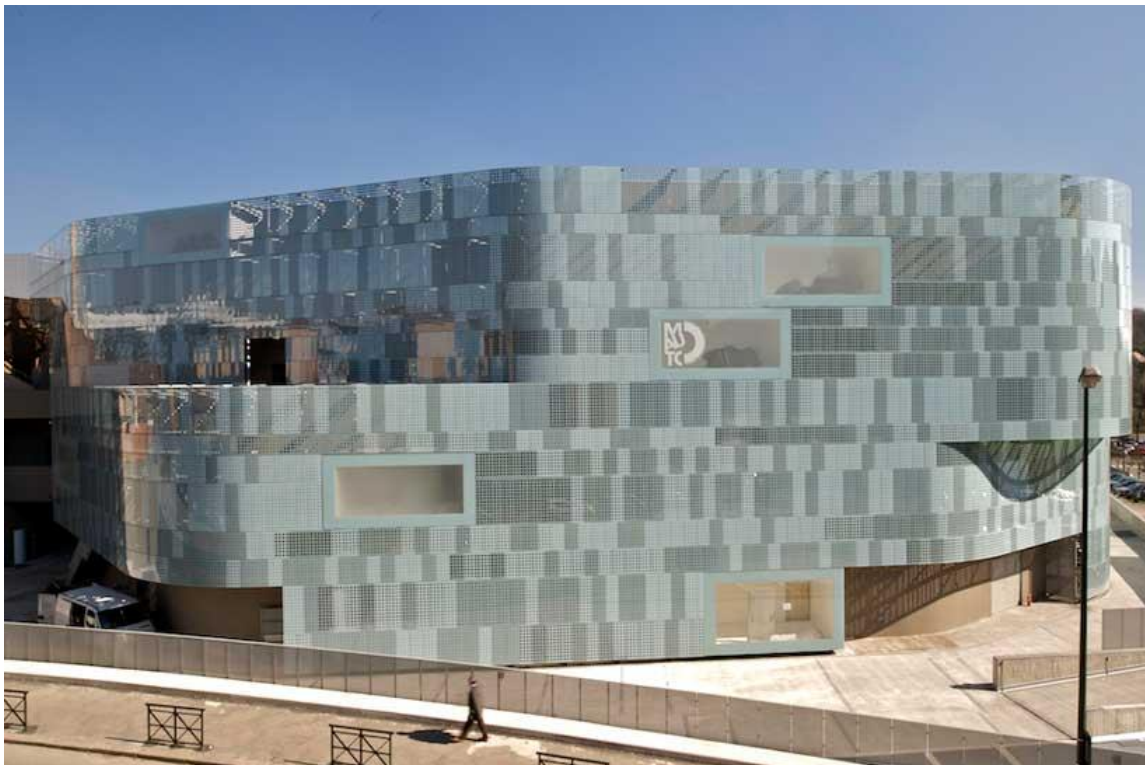
The futuristic facade of Turin's Auto Museum

In addition to the scientific programme, the organizers in Turin arranged visits to excellent restaurants and the time for a stroll through the city of Turin.