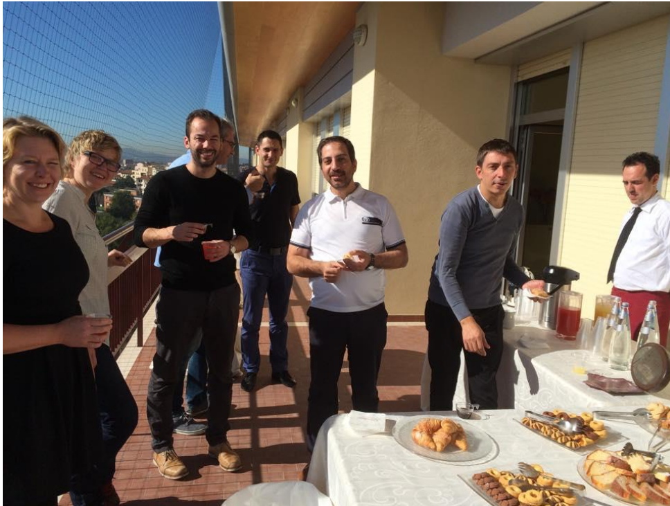
Lunch on a sunny balcony at the CTO, Florence

As in Turin, the visit in Florence also included visits to some wonderful restaurants allowing us to taste the delicious Italian cuisine as well as visits to the beautiful historical city center of Florence.