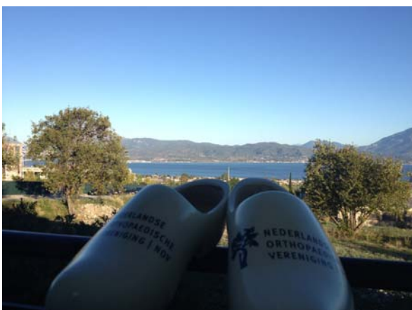
My wooden clogs, safe back home two days after my arrival, sent with my lost-but-found luggage...