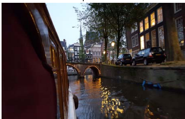
Amsterdam boat trip