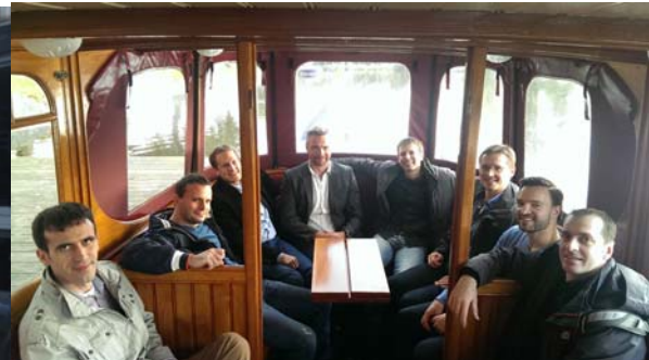
Some of my friends