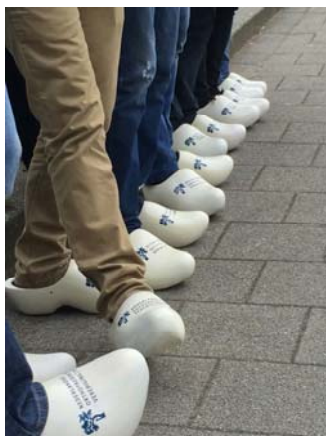
Clogs, a welcome gift.