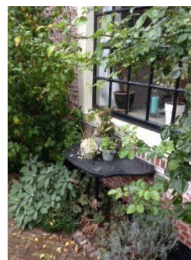
Leiden, beautiful student dorms and walk around the old town. Group picture