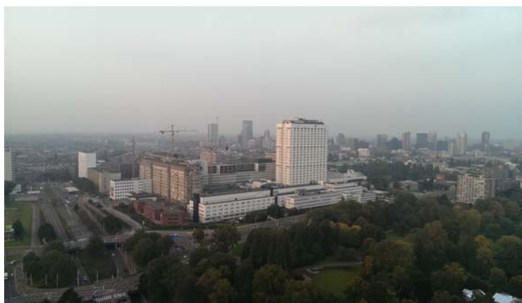
Rotterdam, view of the Erasmus Medical Centre from the Eurostat