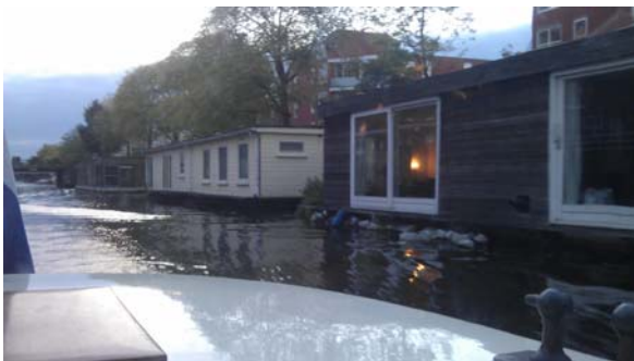
Amsterdam boathouses