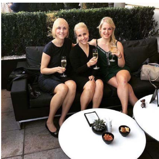
Pic. 8. The ladies of this fellowship.

On our last evening in Otwock, we decided to see the city of Warsaw, had a nice dinner of pirogis and soup (the Polish really love their soups!), and maybe enjoyed a glass of champagne☺.