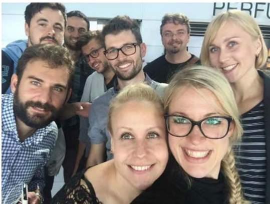
13. Time to go home!