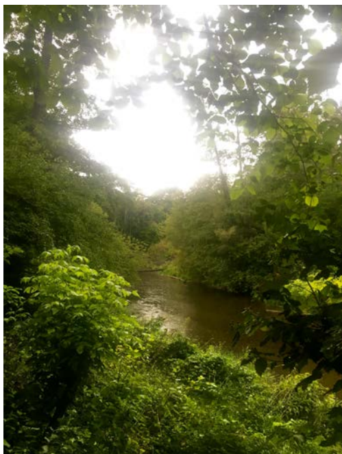
Pic 1. From the run by the River Spyder

I arrived quite early to Chopin airport, Warsaw and travelled to the first hotel, Z-Hotel Business and Spa in Otwock. The hotel was nice, located by the river Spyder, with good jogging routes around. I got settled and after that, went for a run to get to the surroundings. The running route by the river was nice. Unfortunately, we didn't get any information about the first dinner together at the hotel, but luckily our group was active and social and arranged the time by ourselves.