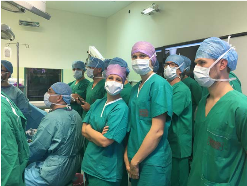
Pic 10. The audience at the ACL reconstruction

After the day at the hospital, I went for a run in Poznan too, ran around the Malta lake and the Old Town of Poznan, beautiful!