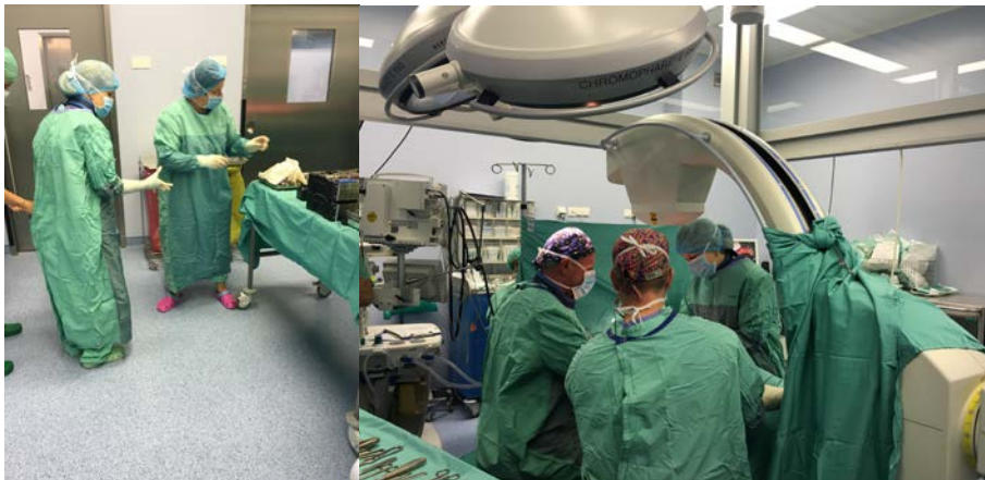
Pic.2. Me scrubbing in (left) and during the operation (right).